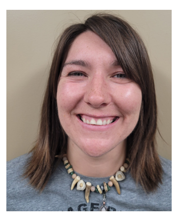
Keegan at youth@xatsull. com.

If you have any requests for all ages or specific age events, please contact